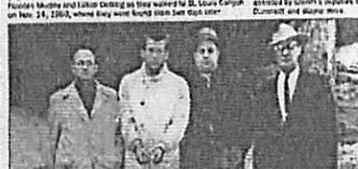
LA SALLE COUNTY INVESTIGATORS ARRIVED AT THE CRASH SITE AFTER THE AIRPLANE CRASHED IN ST. LOUIS CANYON.